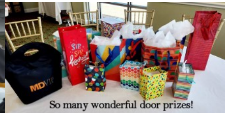
So many wonderful door prizes!