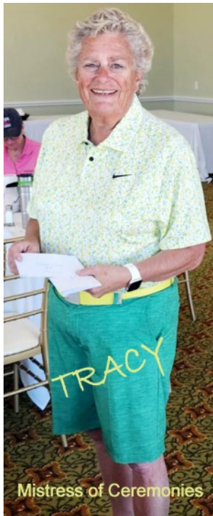
Mistress of Ceremonies